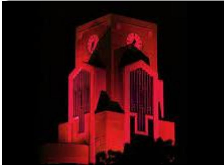
DEAN B. ELLIS LIBRARY LIT RED IN MEMORY OF DR. RUKUS