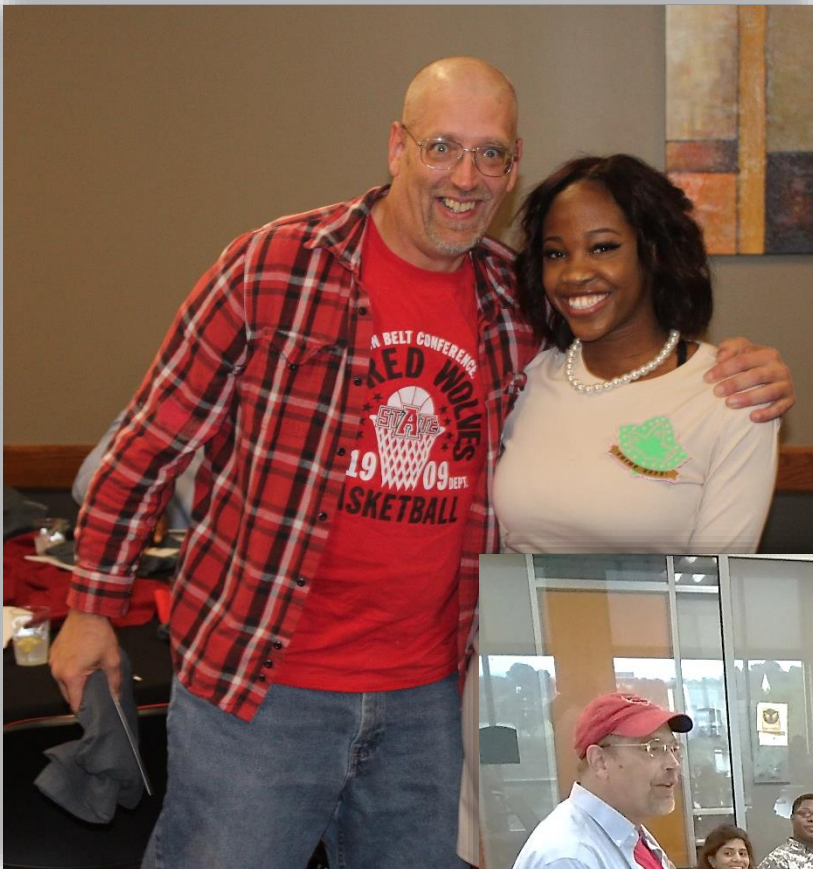
HIS SMILE AND BOISTEROUS LAUGHTER FILLED THE HALLS